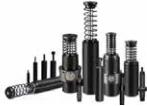
Industrial Shock Absorber