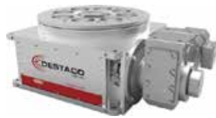
Rotary CAM Indexer