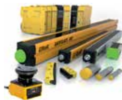
Safety Light Curtains / Scanners