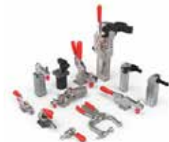
Manual / Power Clamp