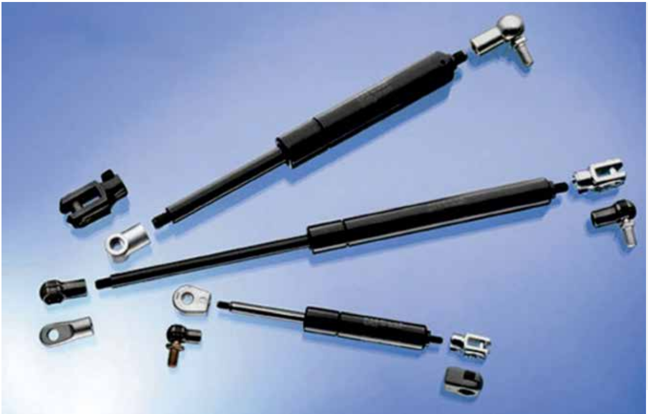
PUSH Type Gas Spring