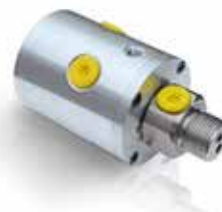
Rotary Union & Joints

We are not just selling products, we are "SELLING SOLUTIONS"