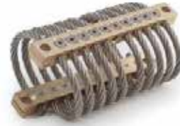
Wire Rope Isolator